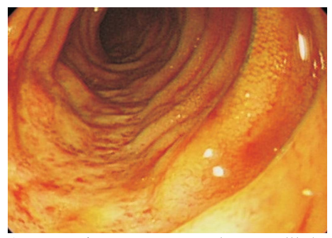
Figure 1. Image of intra-operative enteroscopy. There are several bleeding ulcers in the middle segment of small intestine.

Common risk factors for GI bleeding in the elderly patients, include the use of antiplatelet agents, anticoagulants, nonsteroidal antiinflammatory drugs, a personal history of peptic ulcer disease, esophageal varices, angiodysplasia, colitis, and colonic diverticular disease.<sup>3</sup>